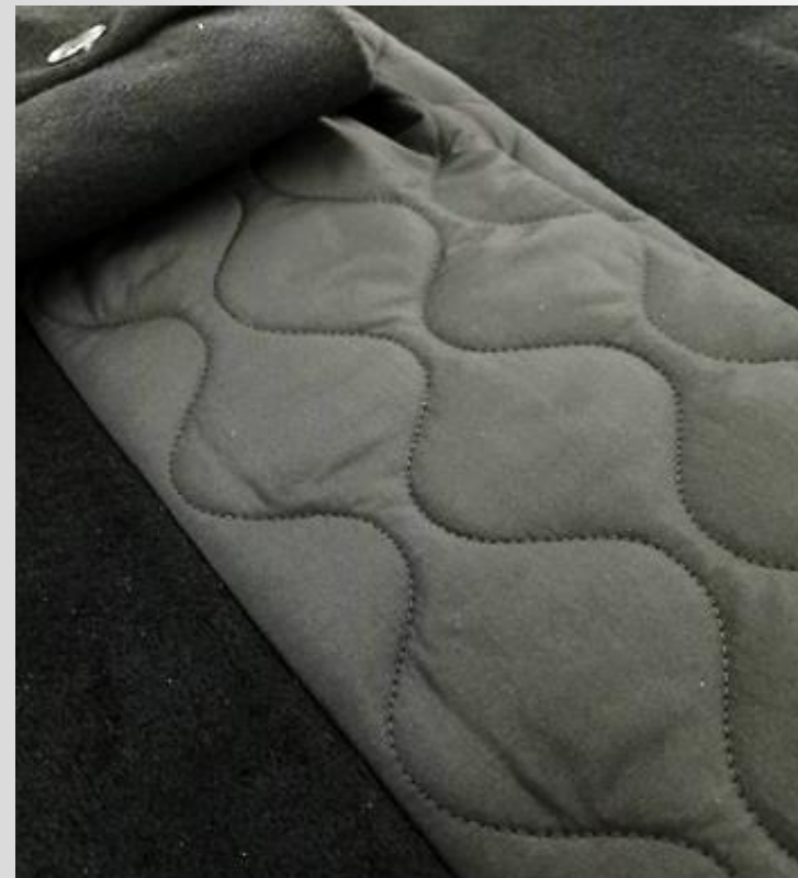
ONION QUILT AT CF