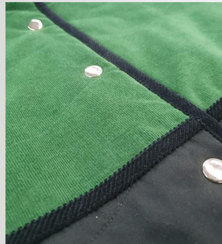
PATCH POCKET IN WAX FABRIC