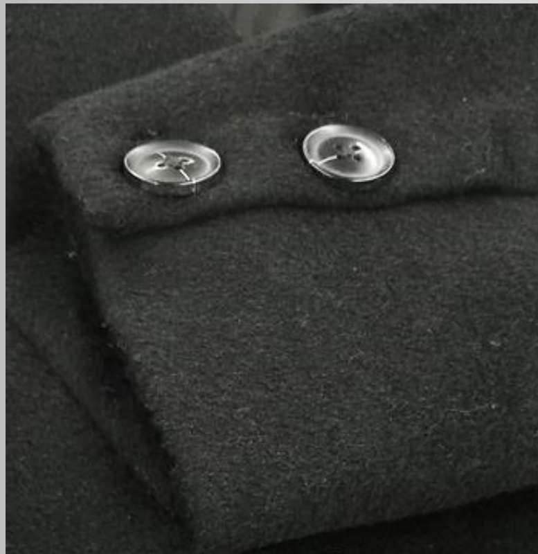
BUTTON CLOSURE AT CUFF