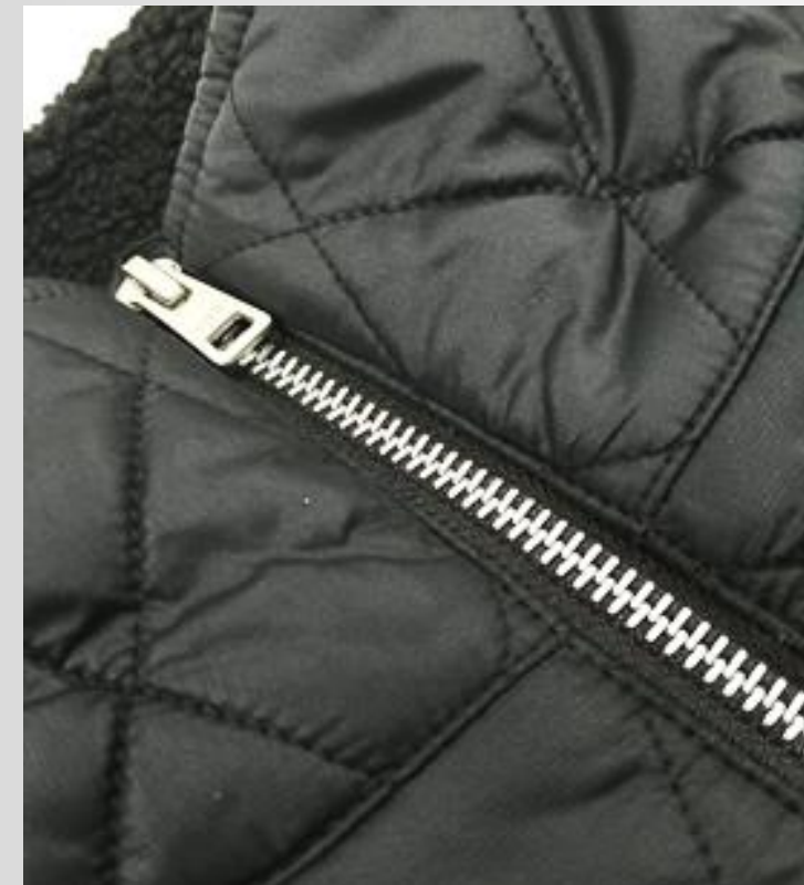
METAL SNAP CLOSURE