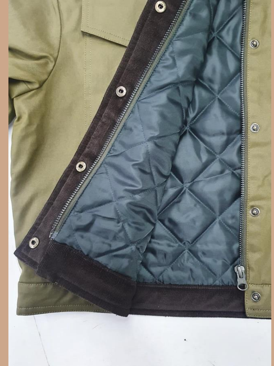
Quilted taffeta lining w/ corduroy facing.