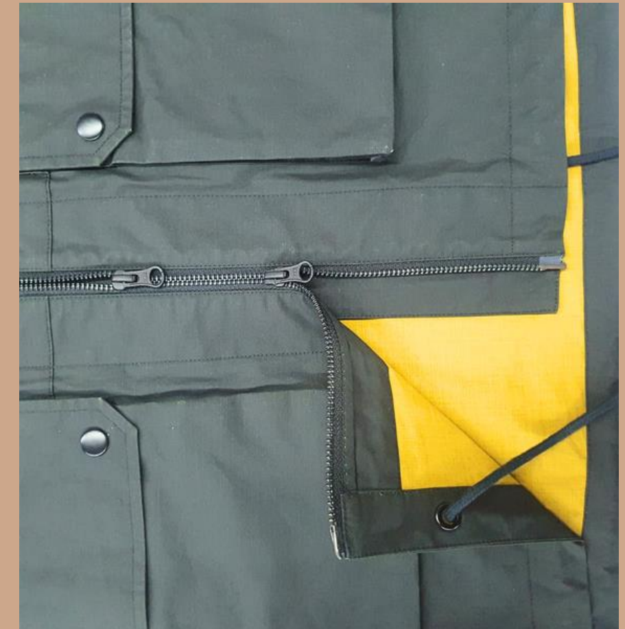
2-way opening YKK metal zipper w/ drawcord adjuster at hem