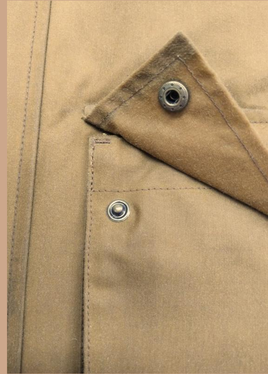
Flap pocket w/ metal snap button