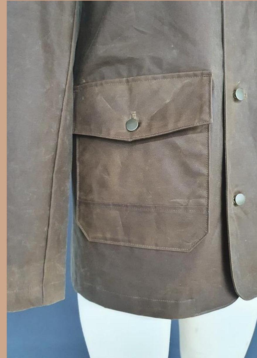
Flap pocket w/ metal shank button