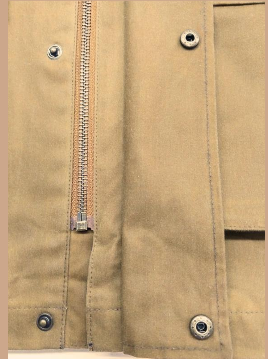
YKK metal zipper w/ snap button