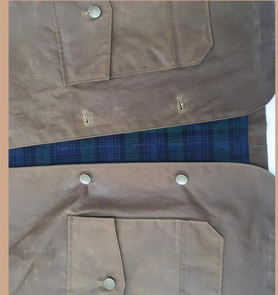
Metal shank button w/ shirt buttonhole