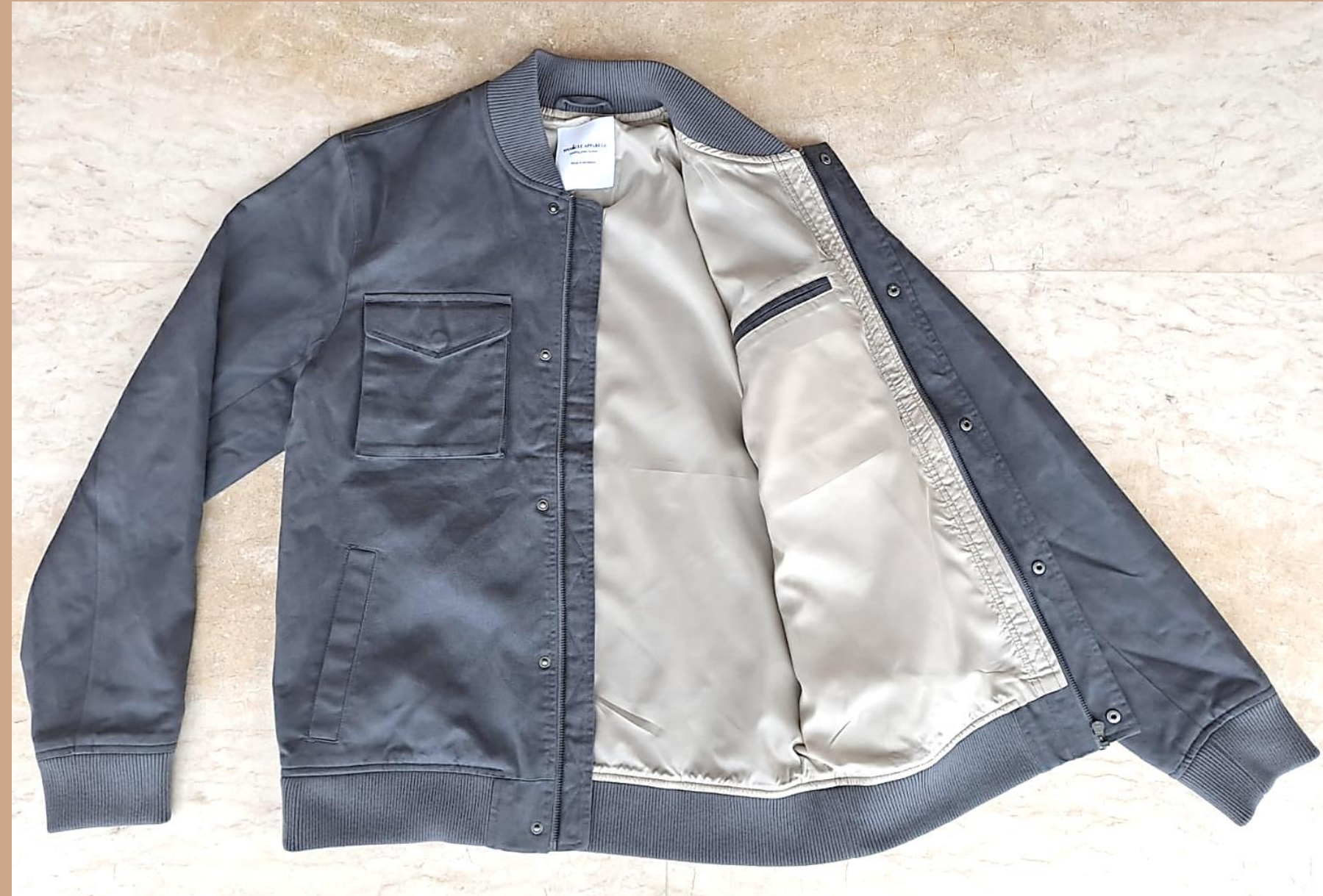
Inside Chest Pocket, CF Zipper opening w/Storm placket 1x1 RIB Collar, Cuff and hem Side Welt pockets Fully Lined jacket