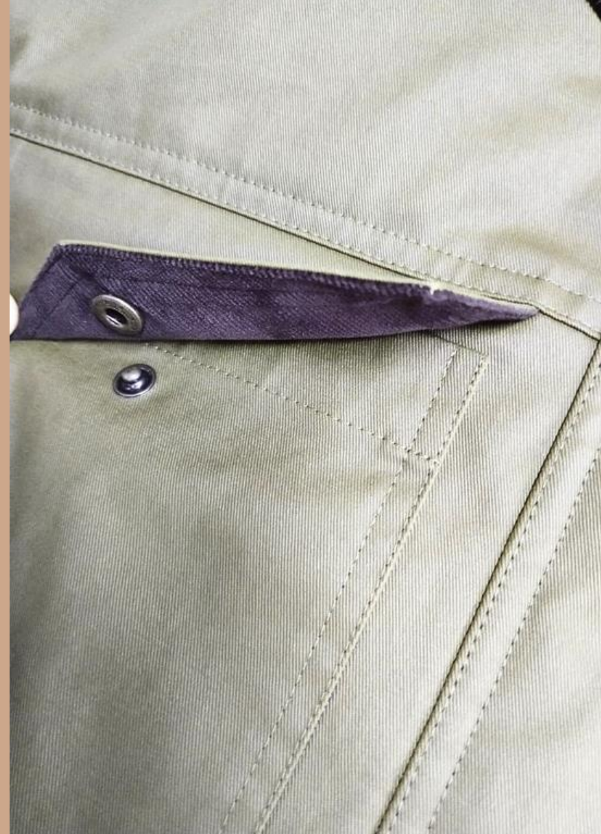
Flap pocket w/ metal snap closure