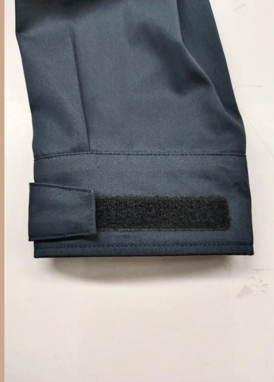
Velcro opening at cuff