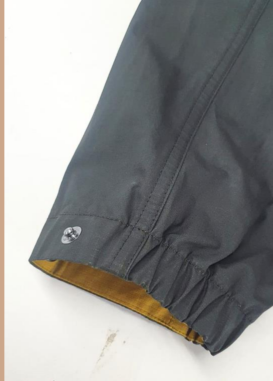
Elasticated cuff w/ metal snap button closure