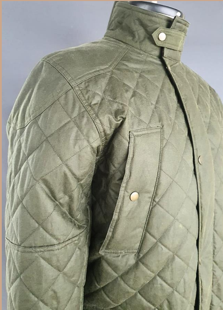
Side chest pocket w/ metal snap closure