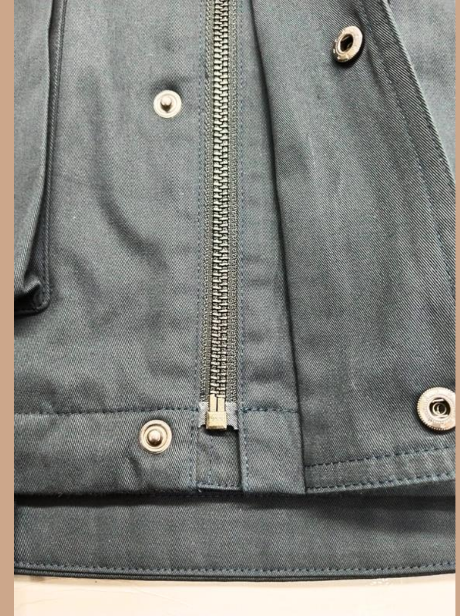
YKK metal zipper w/ snap button