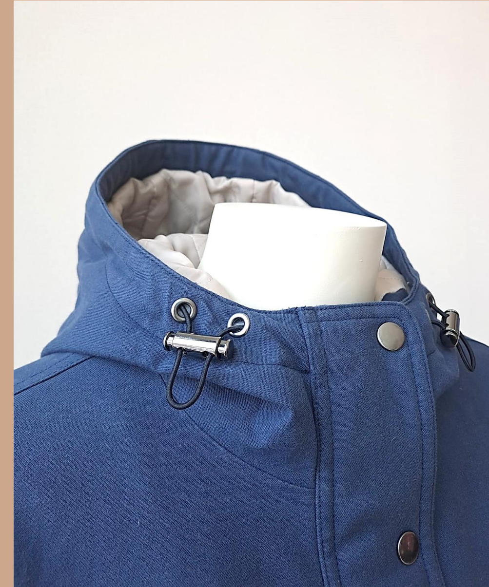
Metal snap closure at placket, Metal cord adjuster at hood.