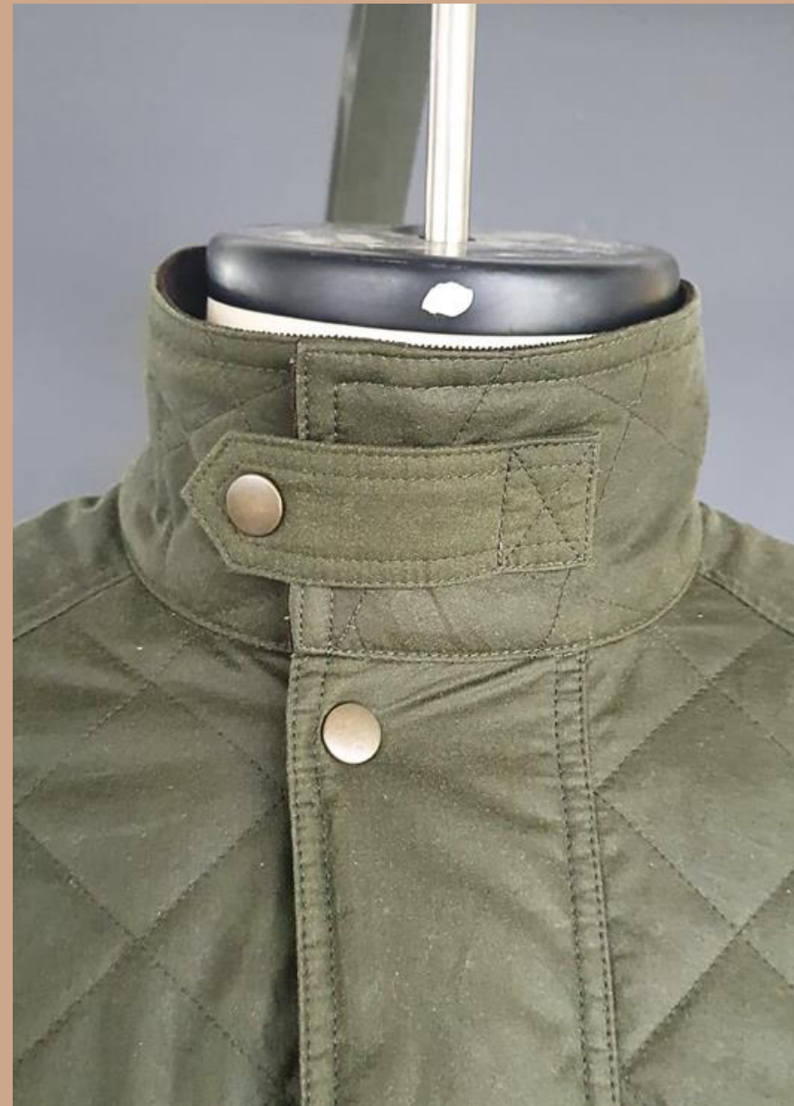
Collar tab with metal snap closure