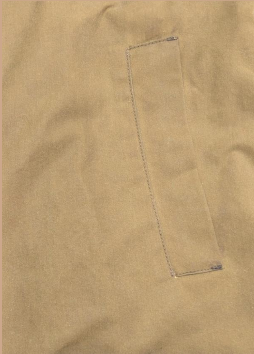
Side chest pocket