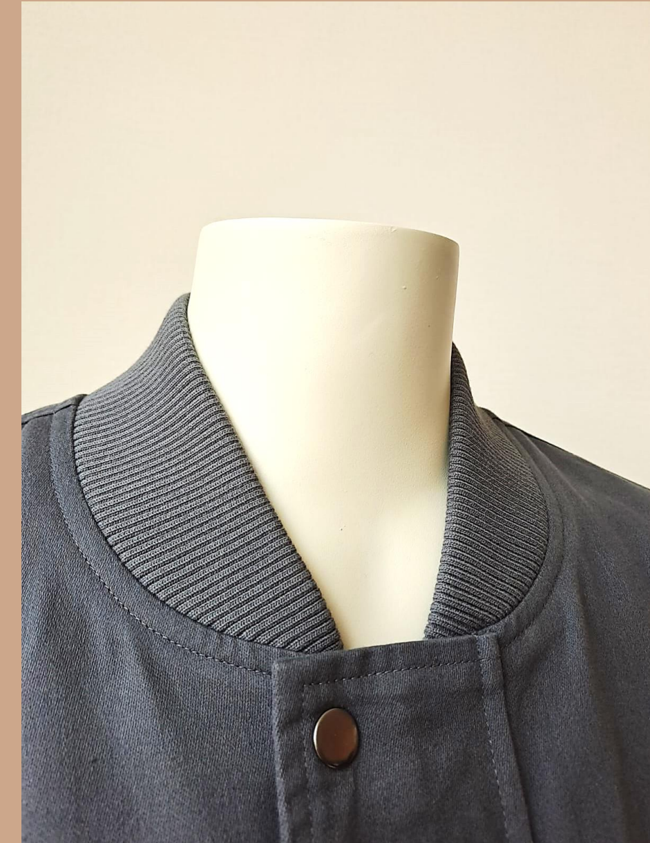
Metal snap closure at placket, 1x1 Rib collar.