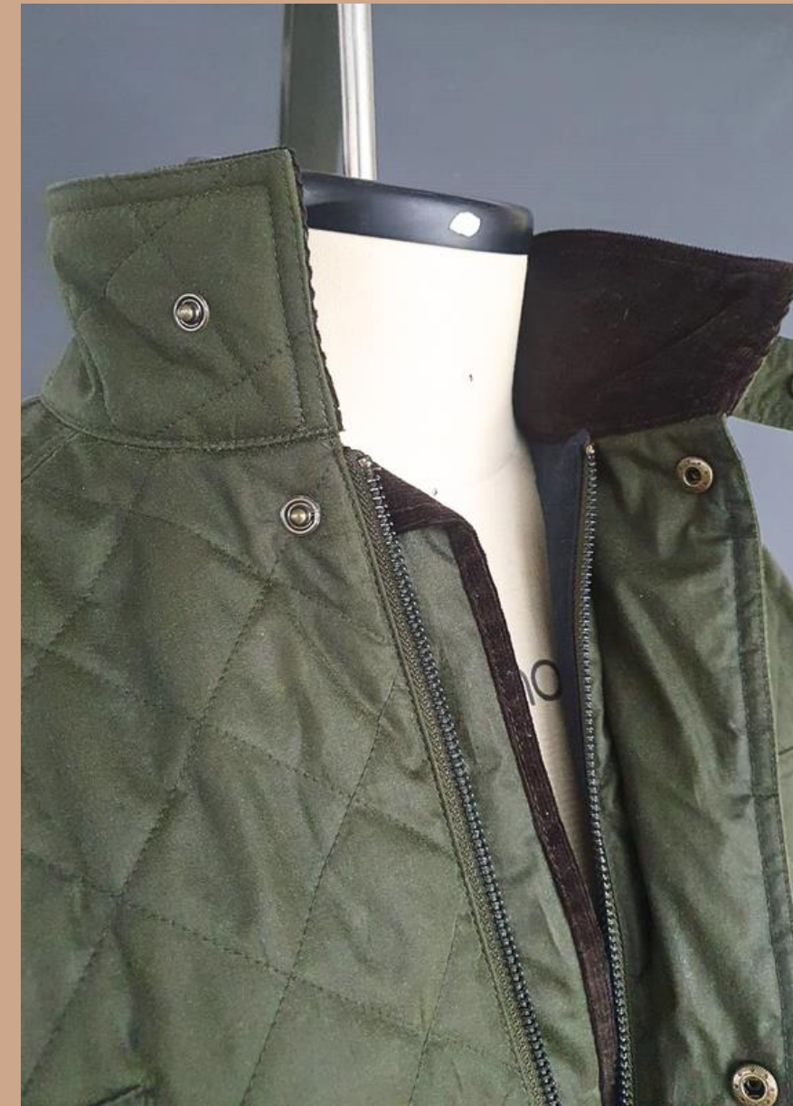
YKK zipper w/ snap btn closure and corduroy facing