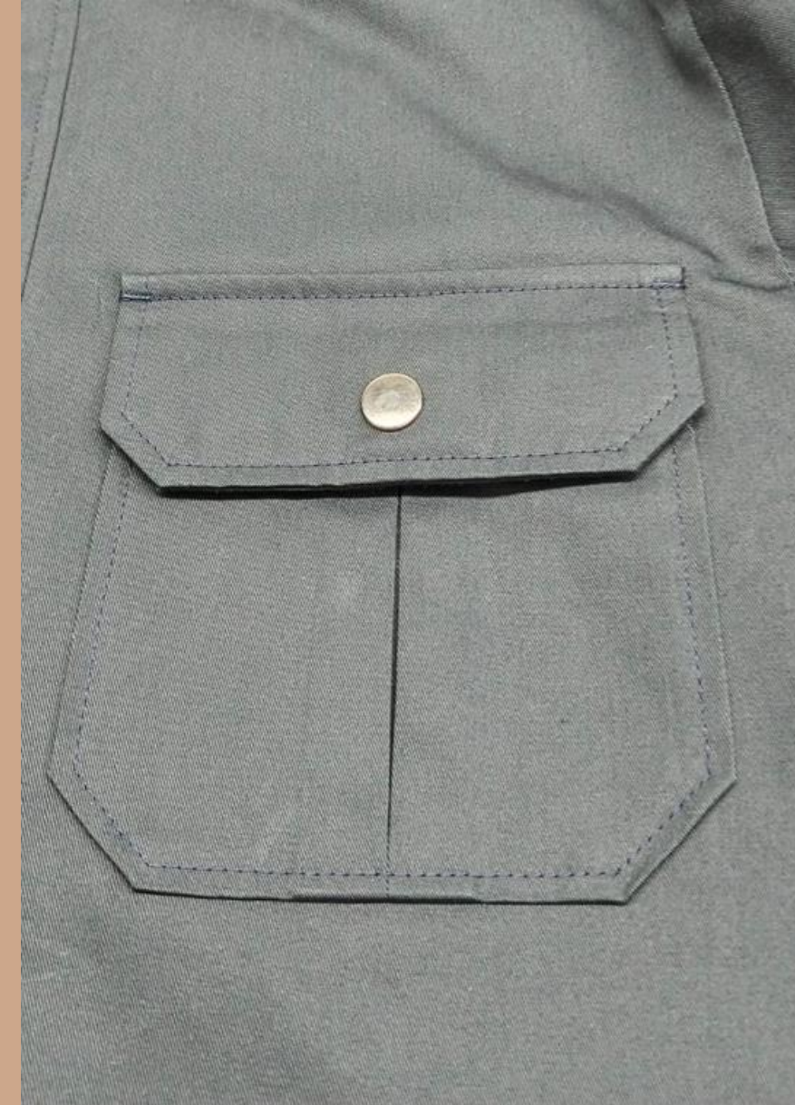
Flap pocket w/ metal snap button