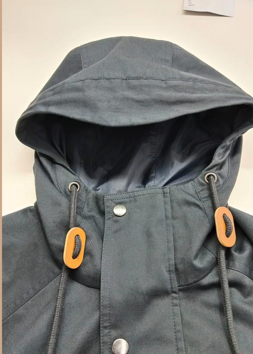
Drawstring with pignose toggle