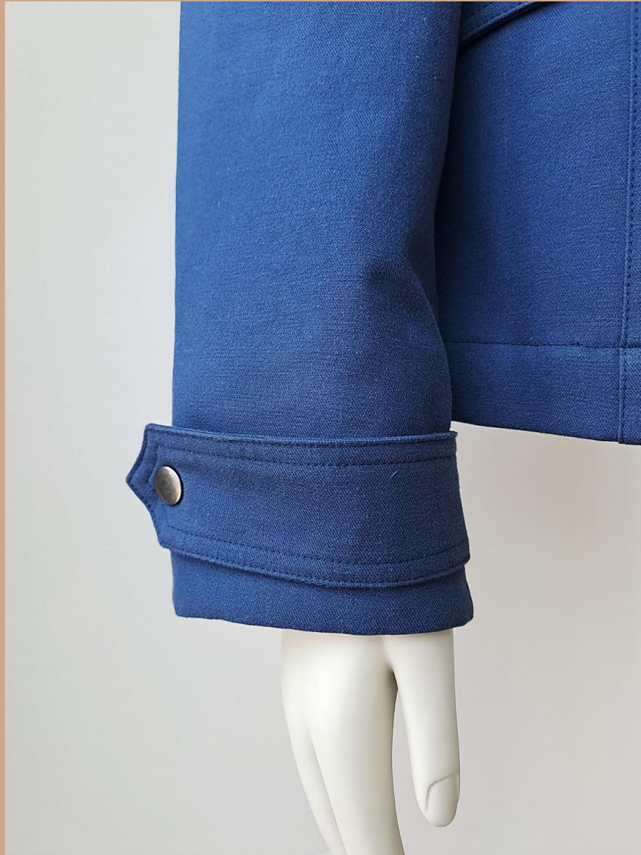
Metal snap adjuster at sleeve cuff