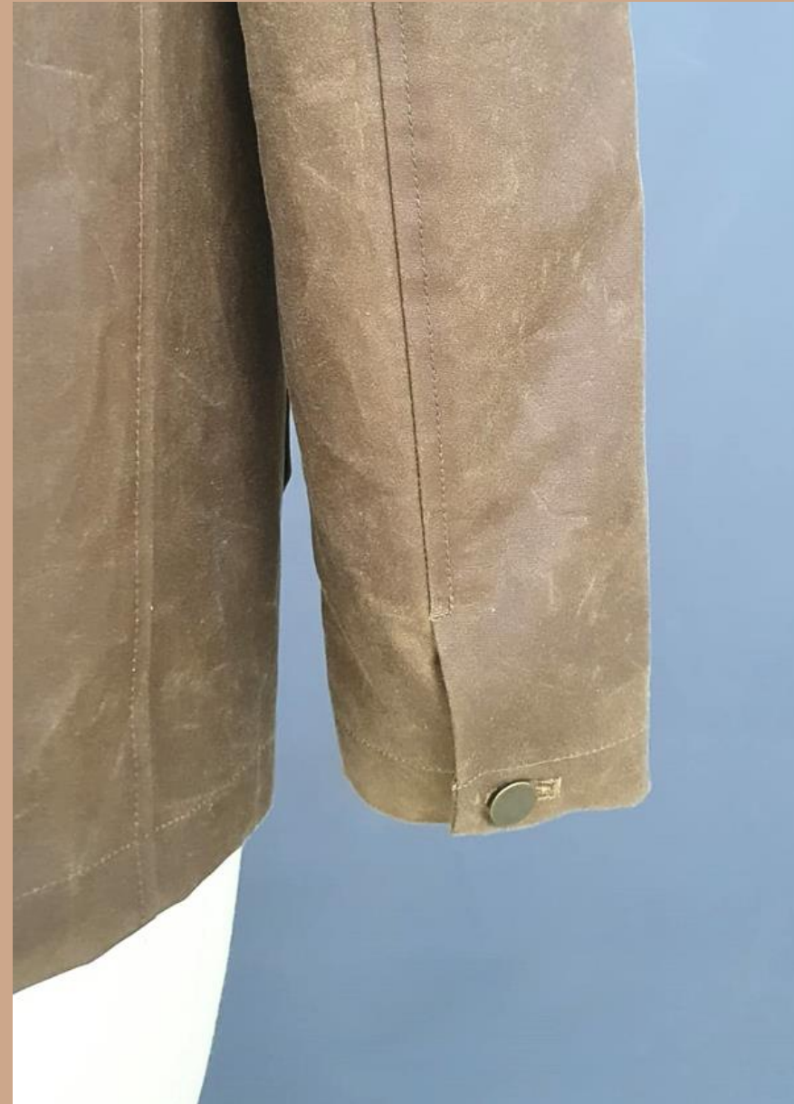
Metal shank button w/ shirt buttonhole