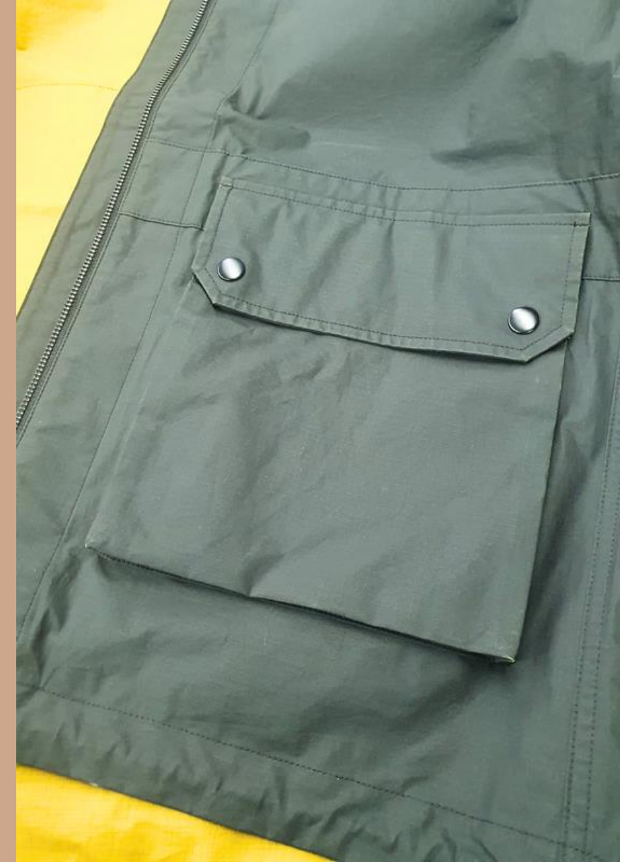
Flap pocket w/ metal snap button