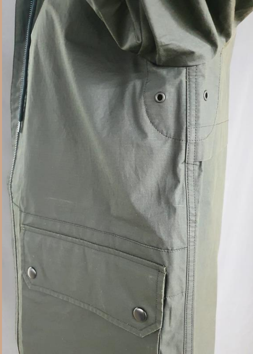
Eyelet hole at underarm