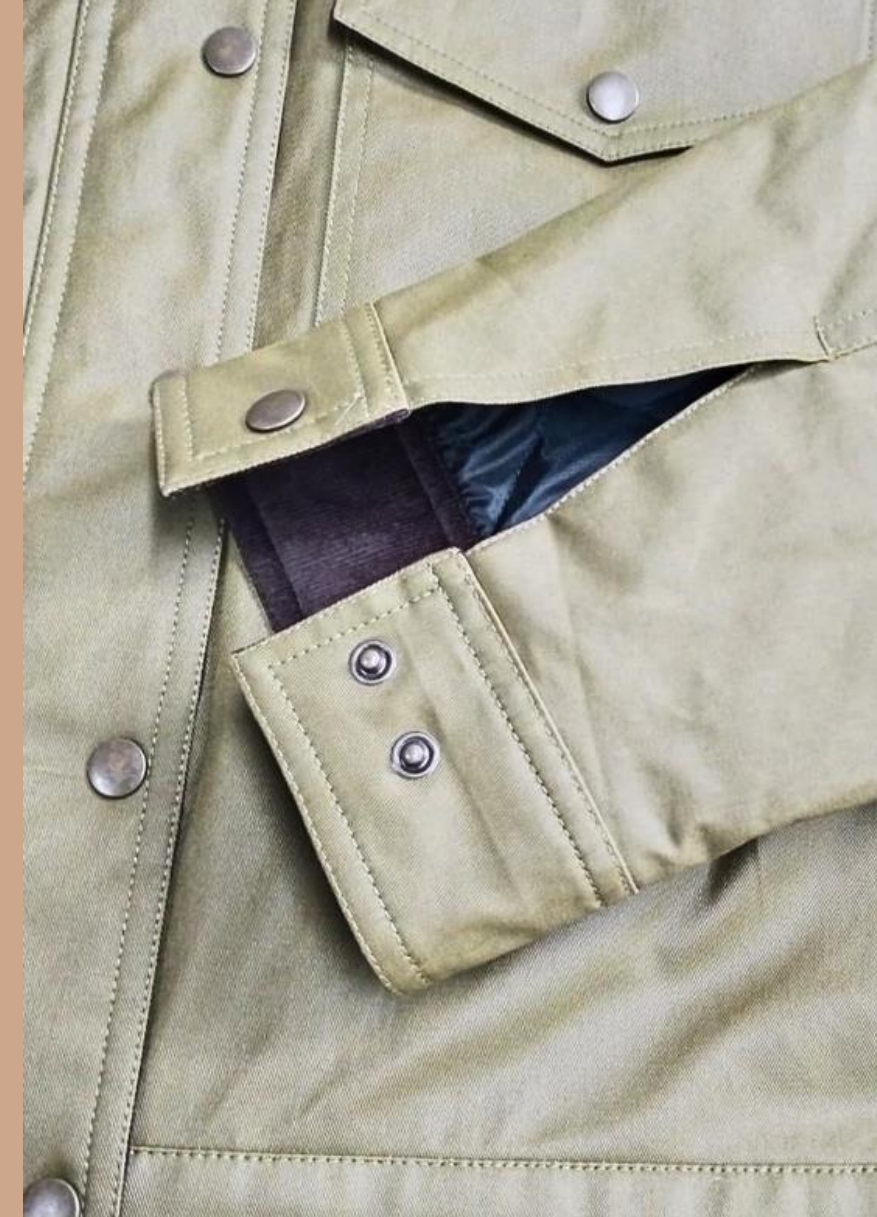
Metal snap button opening at cuff w/ corduroy facing