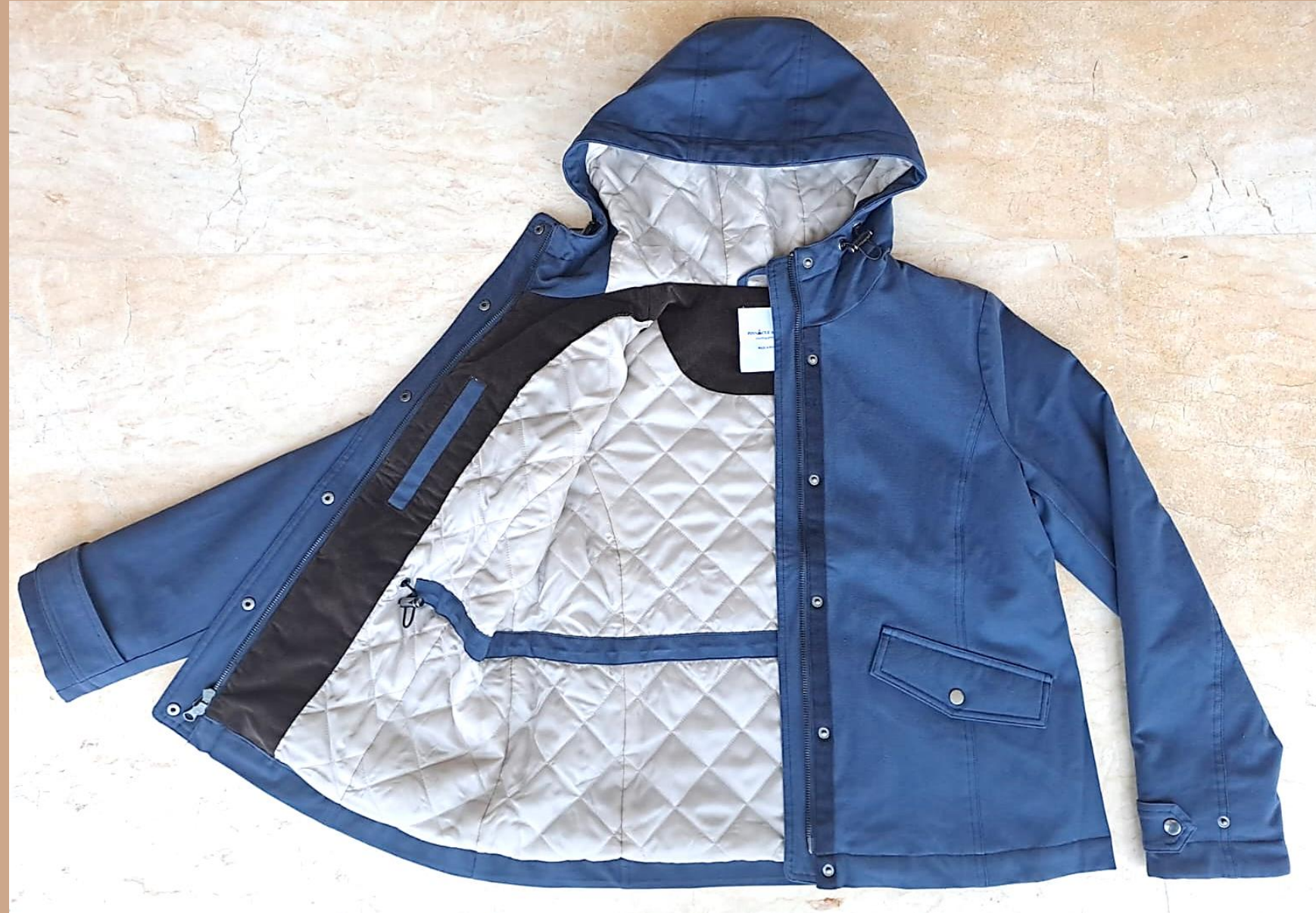
Quilted taffeta lining w/ corduroy facing, Twill Tape at CF Inside waist cord adjuster Inside Chest pocket