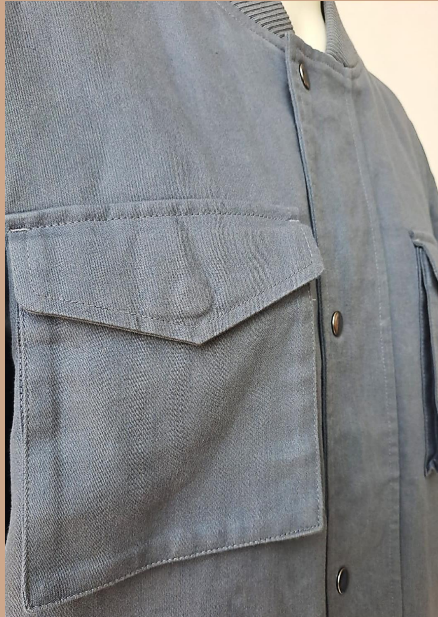
Hidden Snap closure