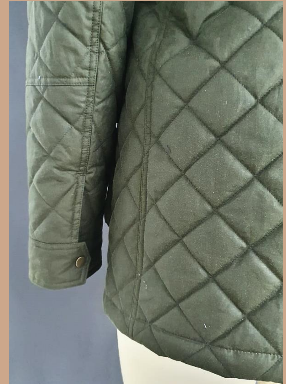
Snap button close at cuff